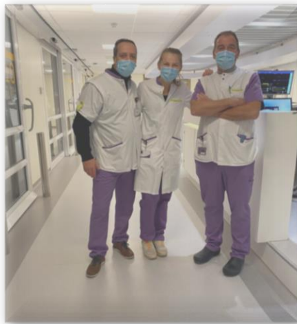
“Every employee now has a personal security guard. It is not just a service, it provides a great sense of security.” OZG