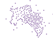
Ommelander Ziekenhuis Groningen

Integration of AiRISTA's Staff Safety solution and the Ascom Healthcare Platform adds location awareness to common hospital workflows.